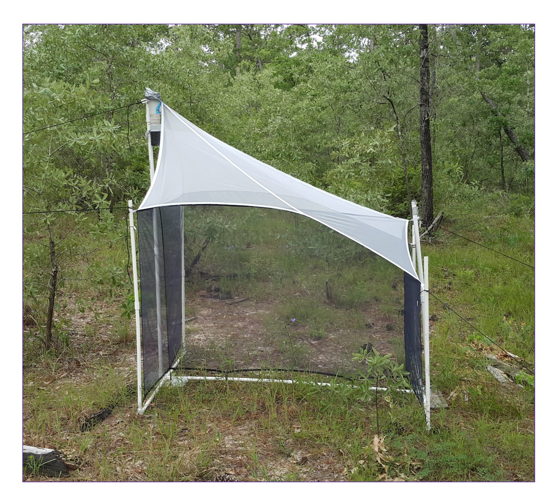
Figure 2. Malaise trap.