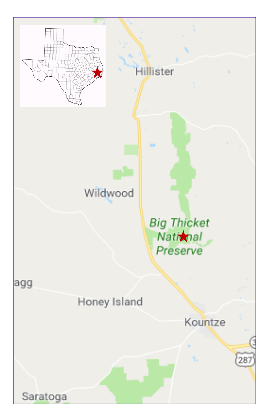
Figure 1. Location of field sites in Hardin County, Texas.

Herein, we report results from these surveys in an effort to determine the impacts of both flood and fire on select groups of insects including Orthoptera (grasshoppers, katydids, and crickets), Myrmeleontidae (antlions), Scarabidae (scarab beetles), Cerambycidae (long-horned beetles), and one group of crabronid wasps ( Pluto sp.).